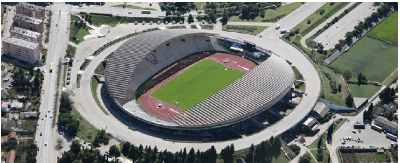
Poljud Stadium, Split Croatia, LEXAN™ THERMOCLEAR™ Sheet installed in 1979!